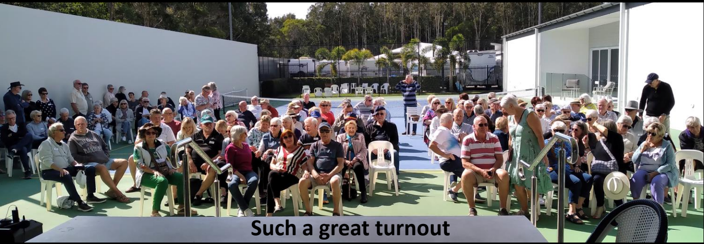
Such a great turnout

Let us all get behind them and support them as it is not an easy task and we appreciate their work.